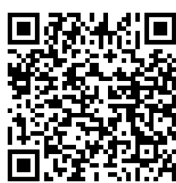
Relief Project Fund